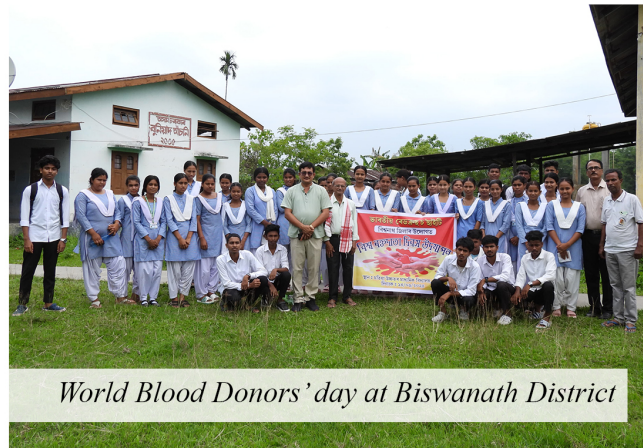
World Blood Donors' day at Biswanath District