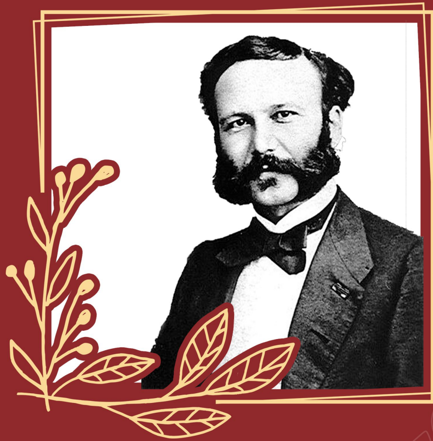
Jean Henry Dunant Founder of world Red Cross & Red Crescent Movement