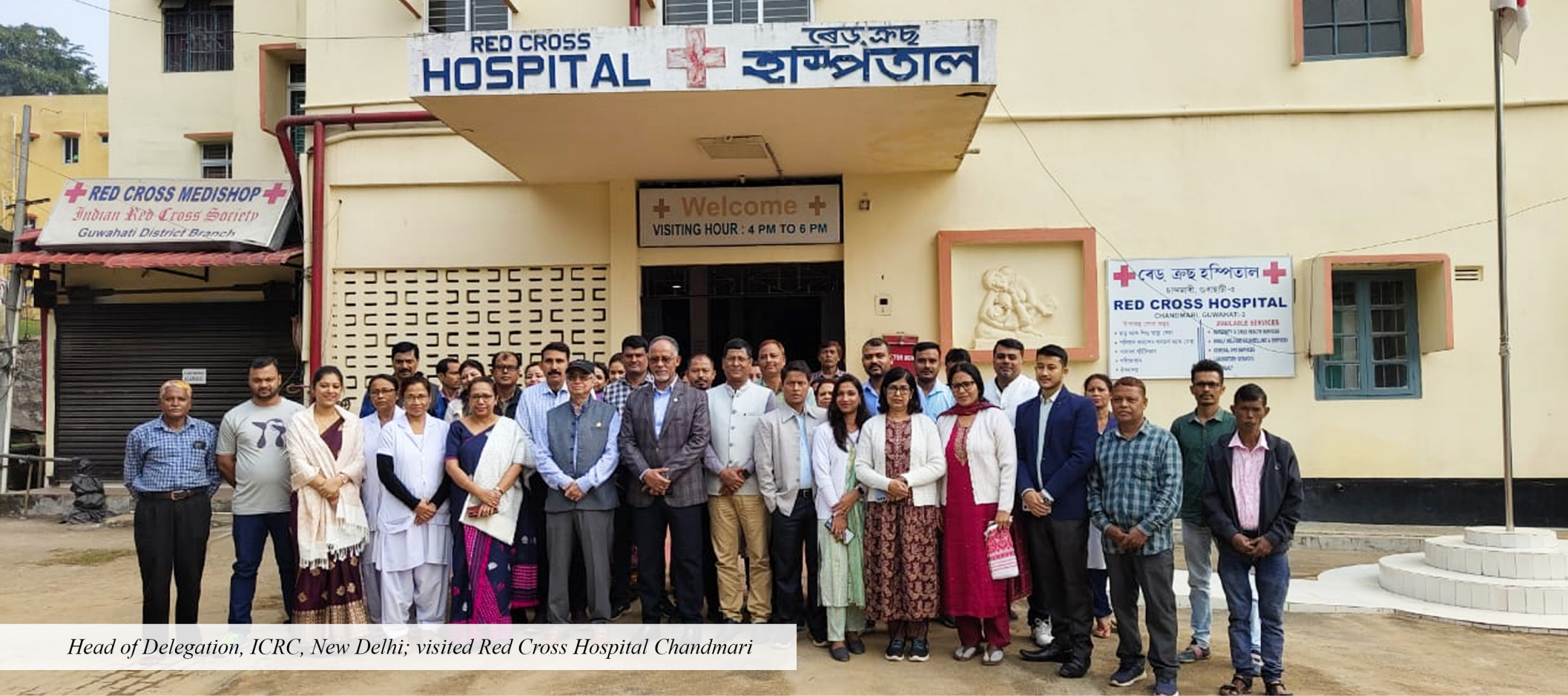
Head of Delegation, ICRC, New Delhi; visited Red Cross Hospital Chandmari