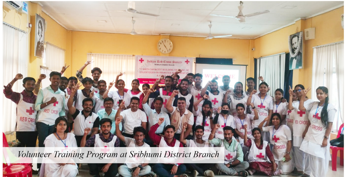
Volunteer Training Program at Sribhumi District Branch