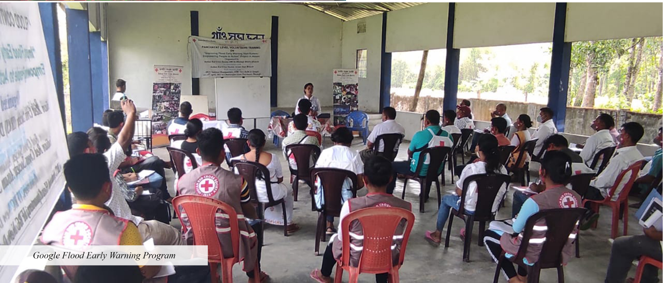
Google Flood Early Warning Program