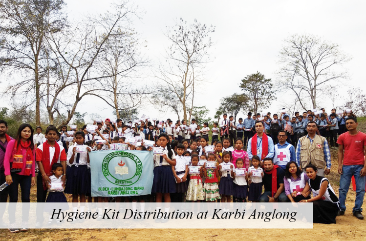
Hygiene Kit Distribution at Karbi Anglong