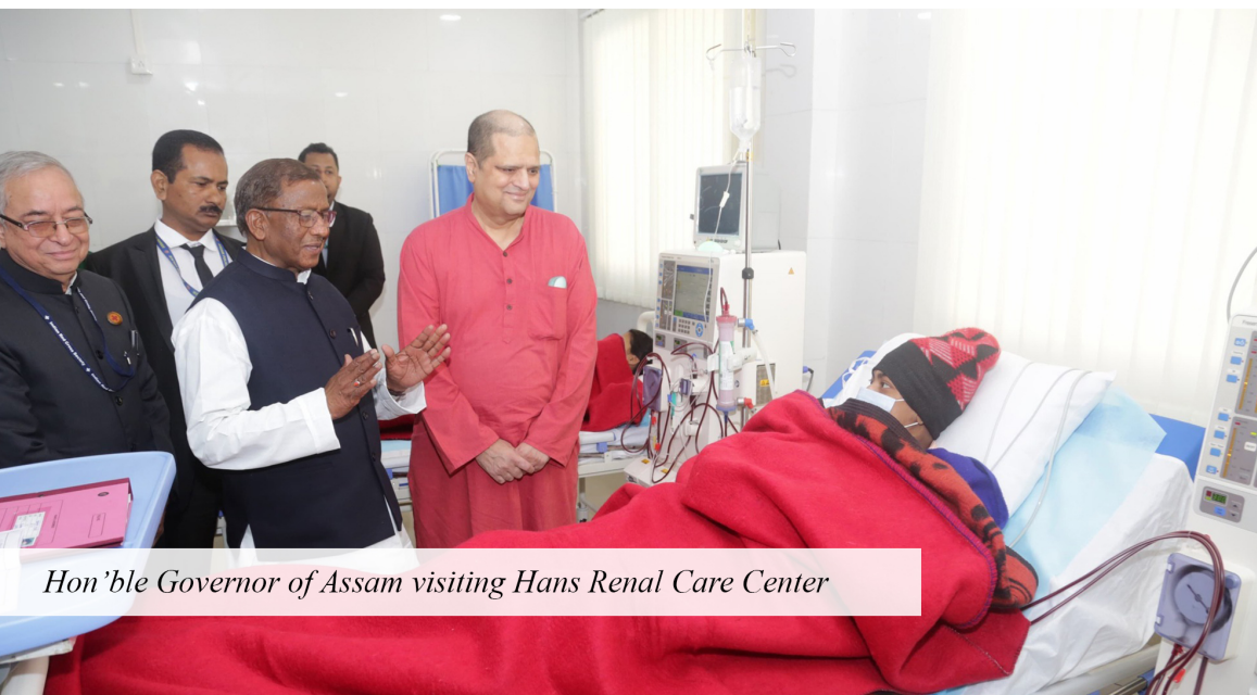
Hon'ble Governor of Assam visiting Hans Renal Care Center