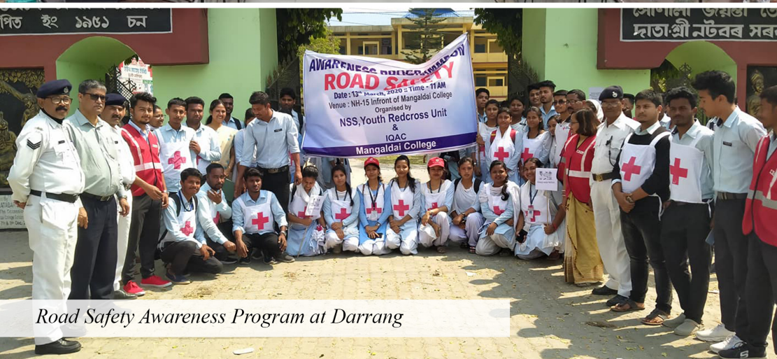
Road Safety Awareness Program at Darrang