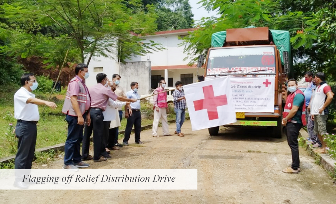
Flagging off Relief Distribution Drive