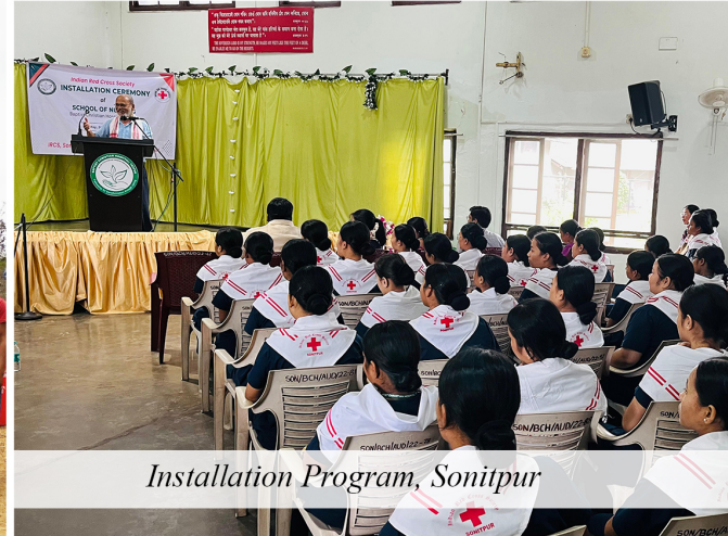
Installation Program, Sonitpur