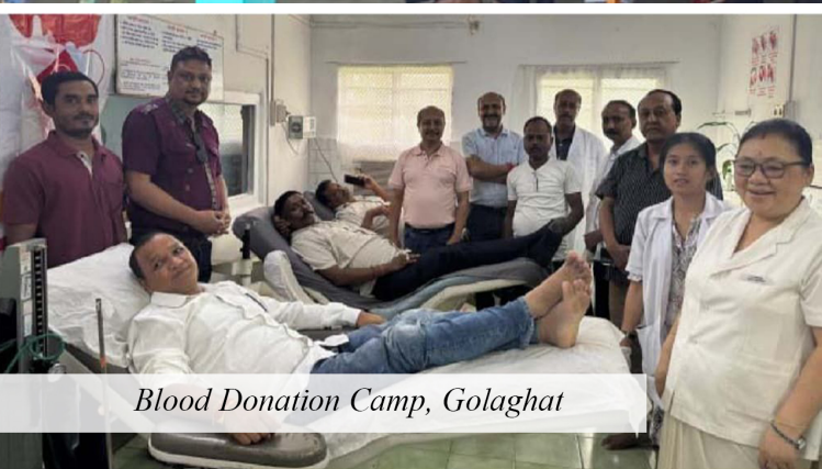
Blood Donation Camp, Golaghat