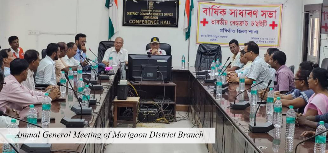
Annual General Meeting of Morigaon District Branch