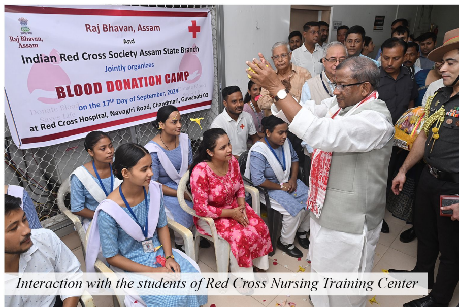
Interaction with the students of Red Cross Nursing Training Center