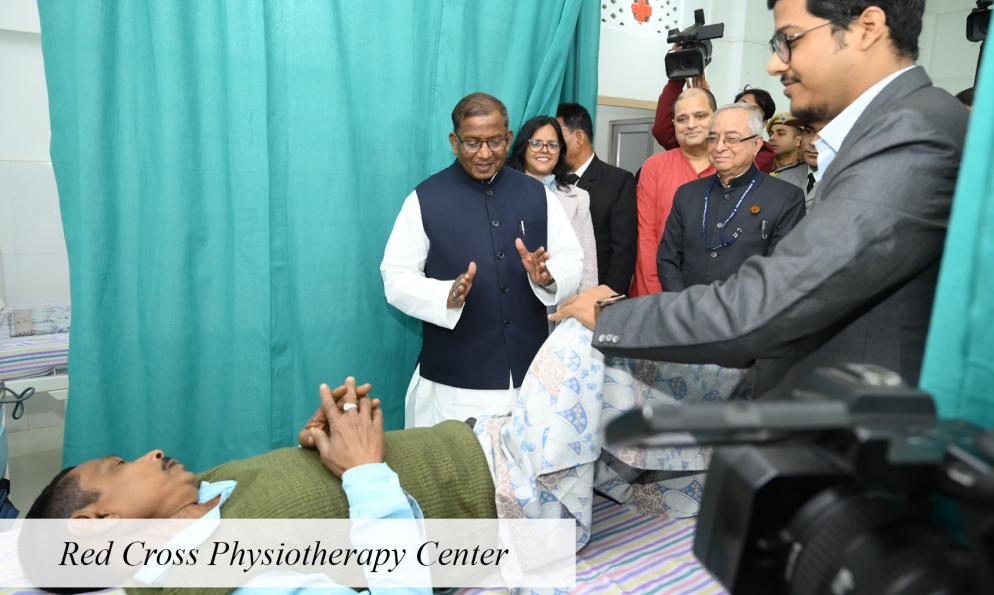
Red Cross Physiotherapy Center