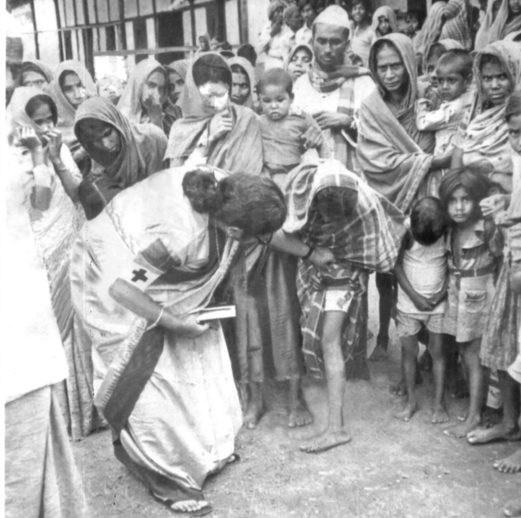
Nelley violence 1984