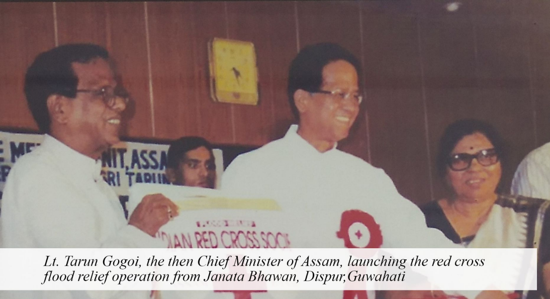
Lt. Tarun Gogoi, the then Chief Minister of Assam, launching the red cross flood relief operation from Janata Bhawan, Dispur, Guwahati