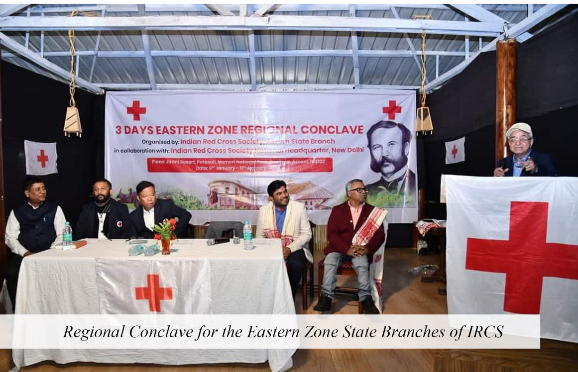
Regional Conclave for the Eastern Zone State Branches of IRCS