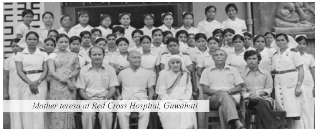
Mother Teresa at Red Cross Hospital, Guwahati