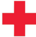
RED CROSS EMBLEM

Only for Red Cross staff and on Red Cross Properties