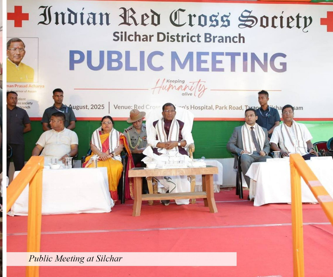
Public Meeting at Silchar