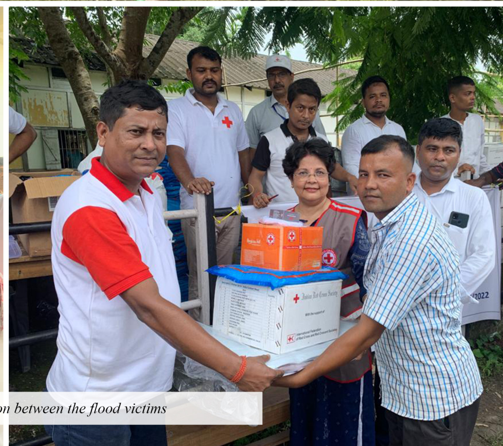
Relief materials distribution between the flood victims