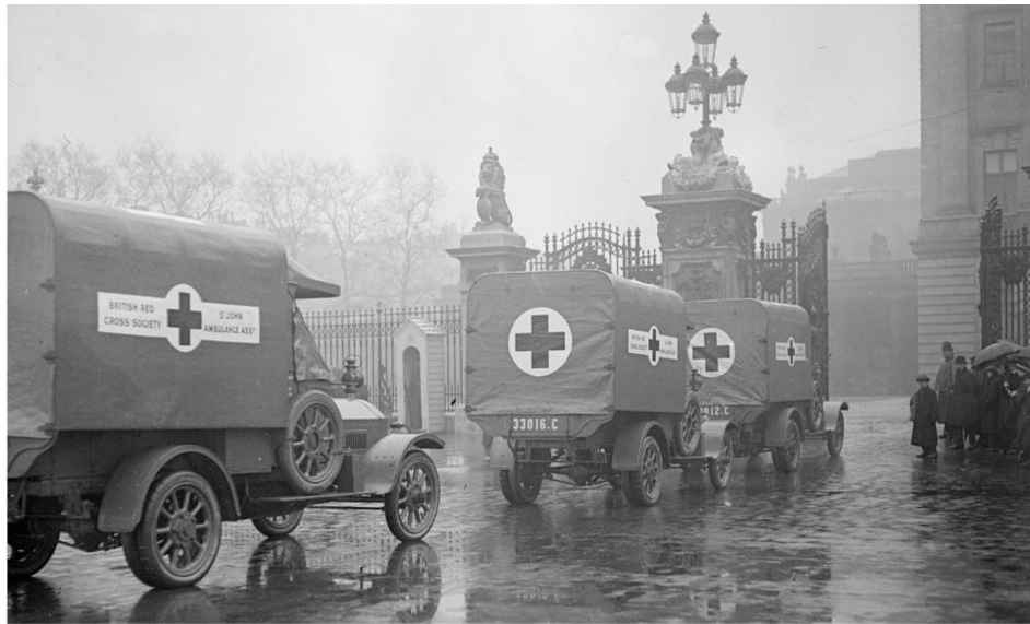
The British Red Cross enters the gates of Buckingham Palace during the first world war.

T he Red Cross movement began in 1863 in Geneva, Switzerland, founded by Henry Dunant. Guided by the seven Fundamental Principles—Humanity, Impartiality, Neutrality, Independence, Voluntary Service, Unity, and Universality—the Red Cross and Red Crescent Movement today is the world's largest humanitarian network, present in 190+ countries.