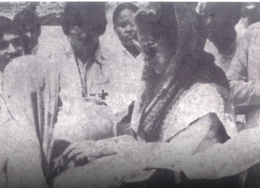
Lt. Indira Gandhi, the then Prime Minister of India Distributing the Red Cross relief materials to the victims of Nallee '83