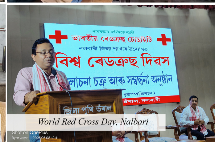
World Red Cross Day, Nalbari