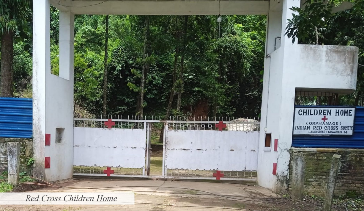
Red Cross Children Home