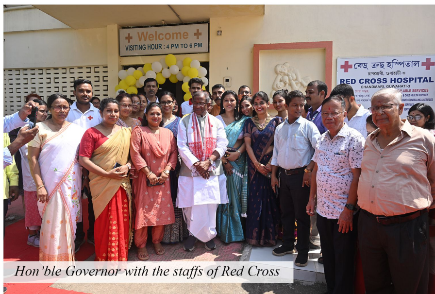
Hon'ble Governor with the staffs of Red Cross