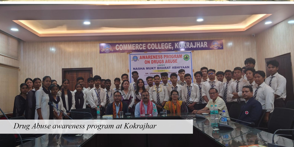
Drug Abuse awareness program at Kokrajhar