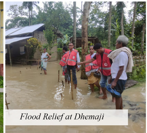
Flood Relief at Dhemaji