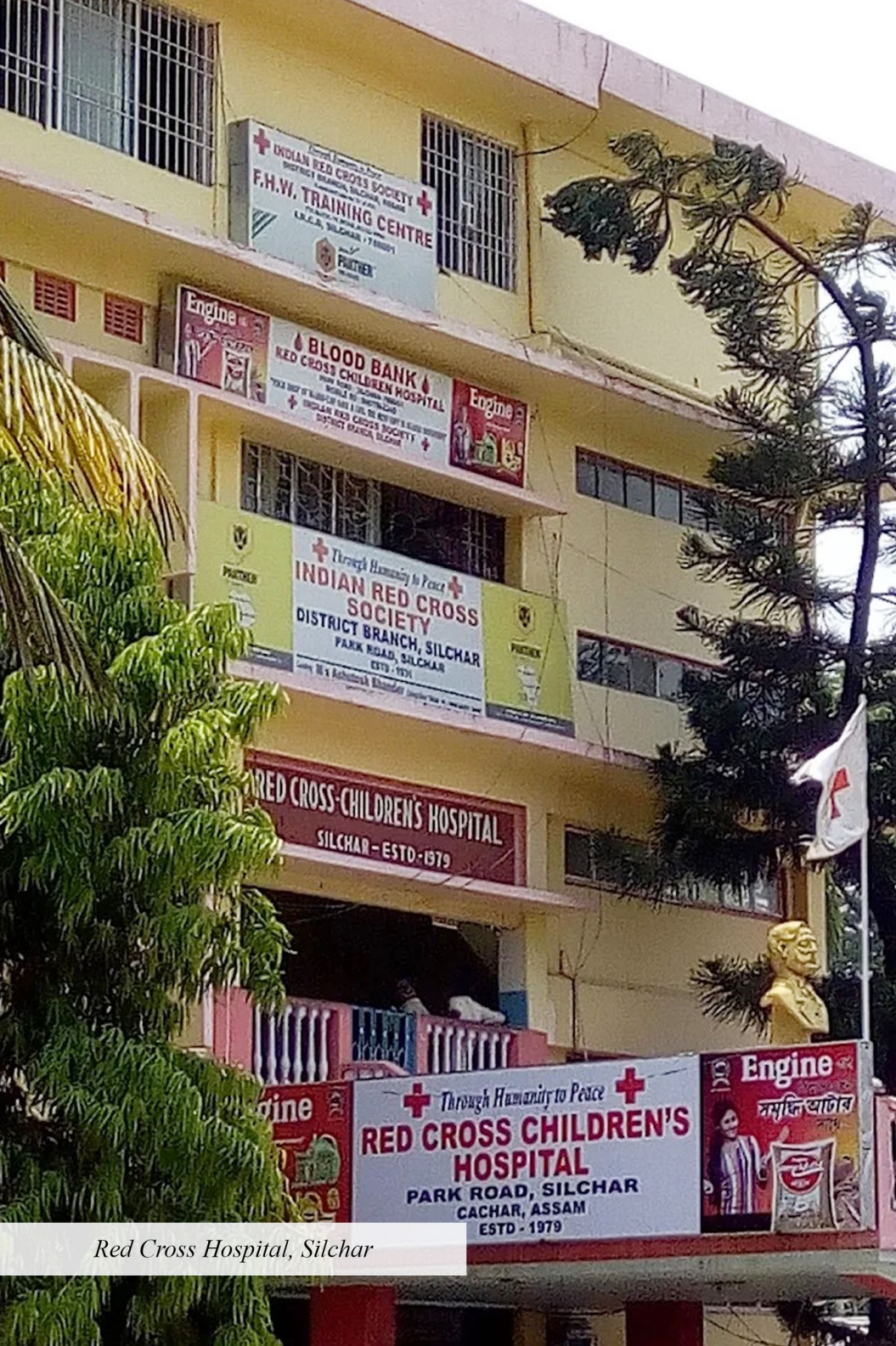
Red Cross Hospital, Silchar