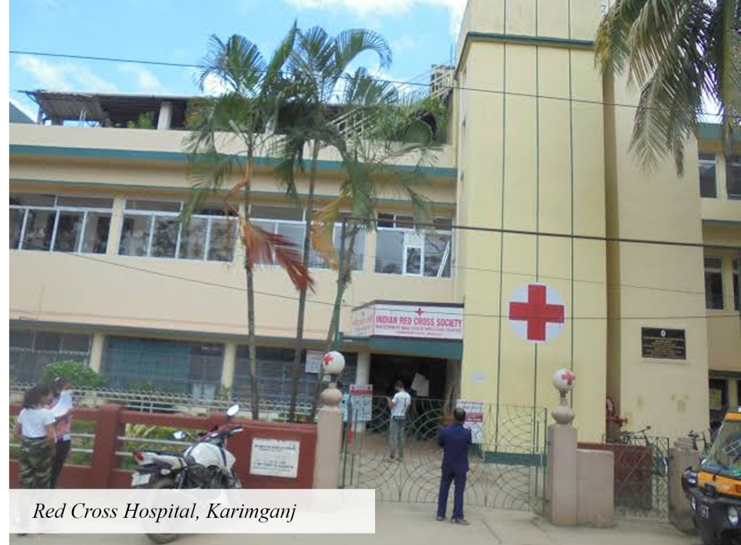
Red Cross Hospital, Karimganj