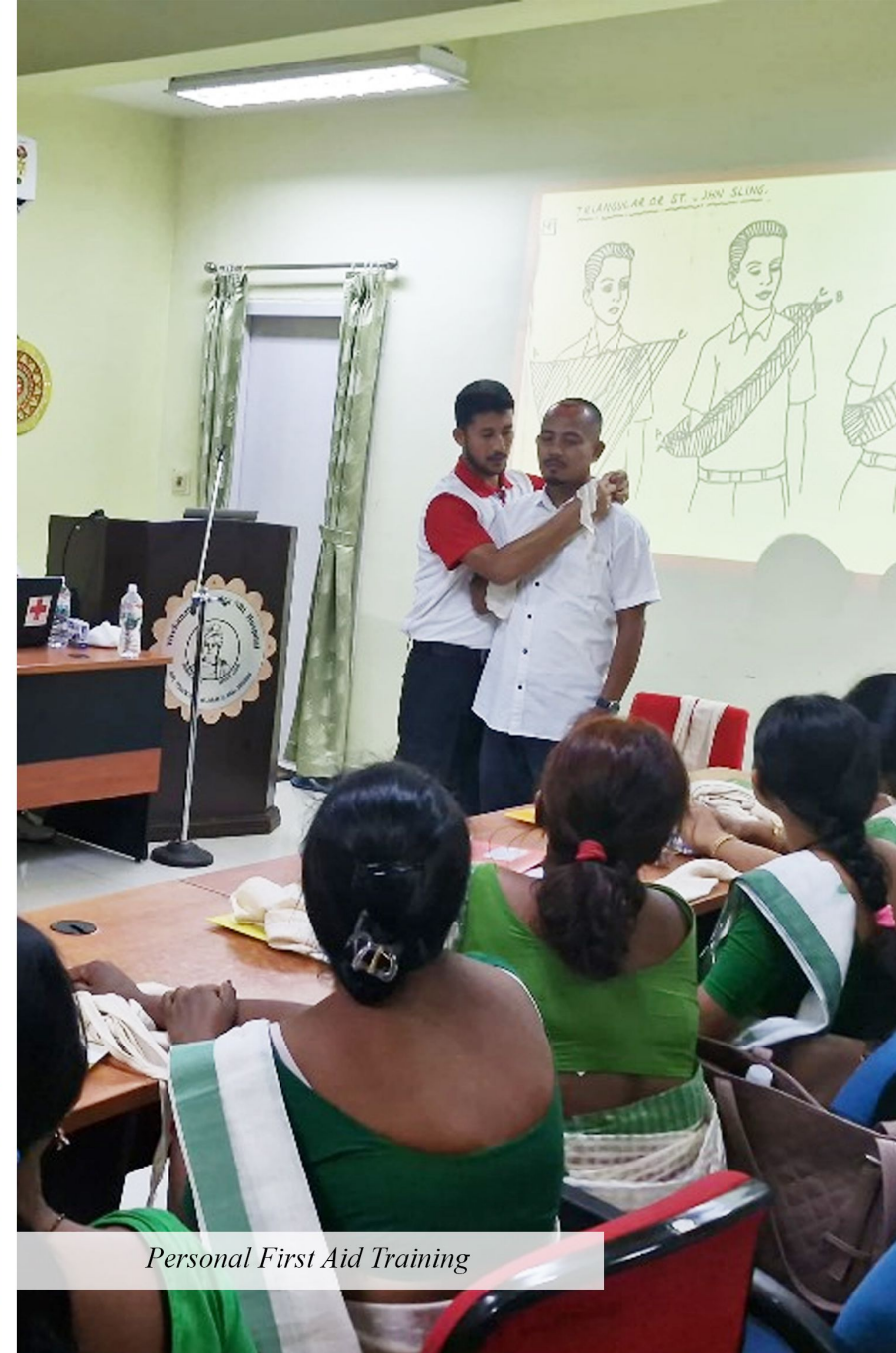
Personal First Aid Training