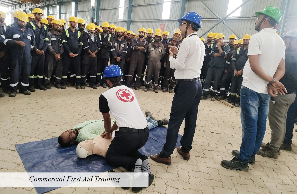
Commercial First Aid Training