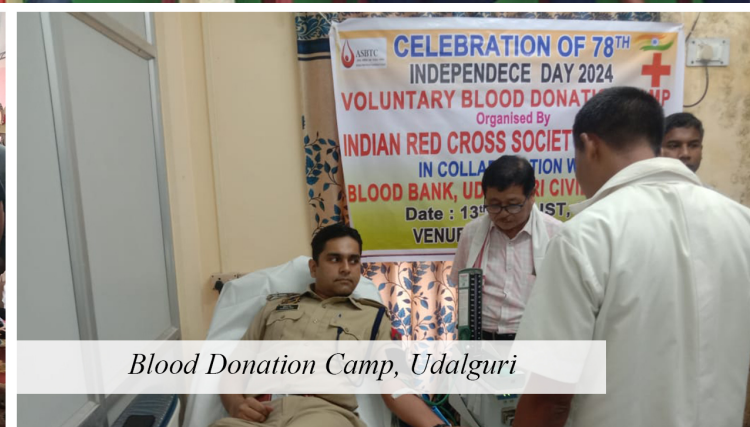
Blood Donation Camp, Udalguri