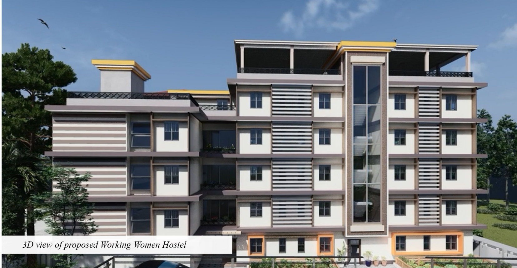
3D view of proposed Working Women Hostel