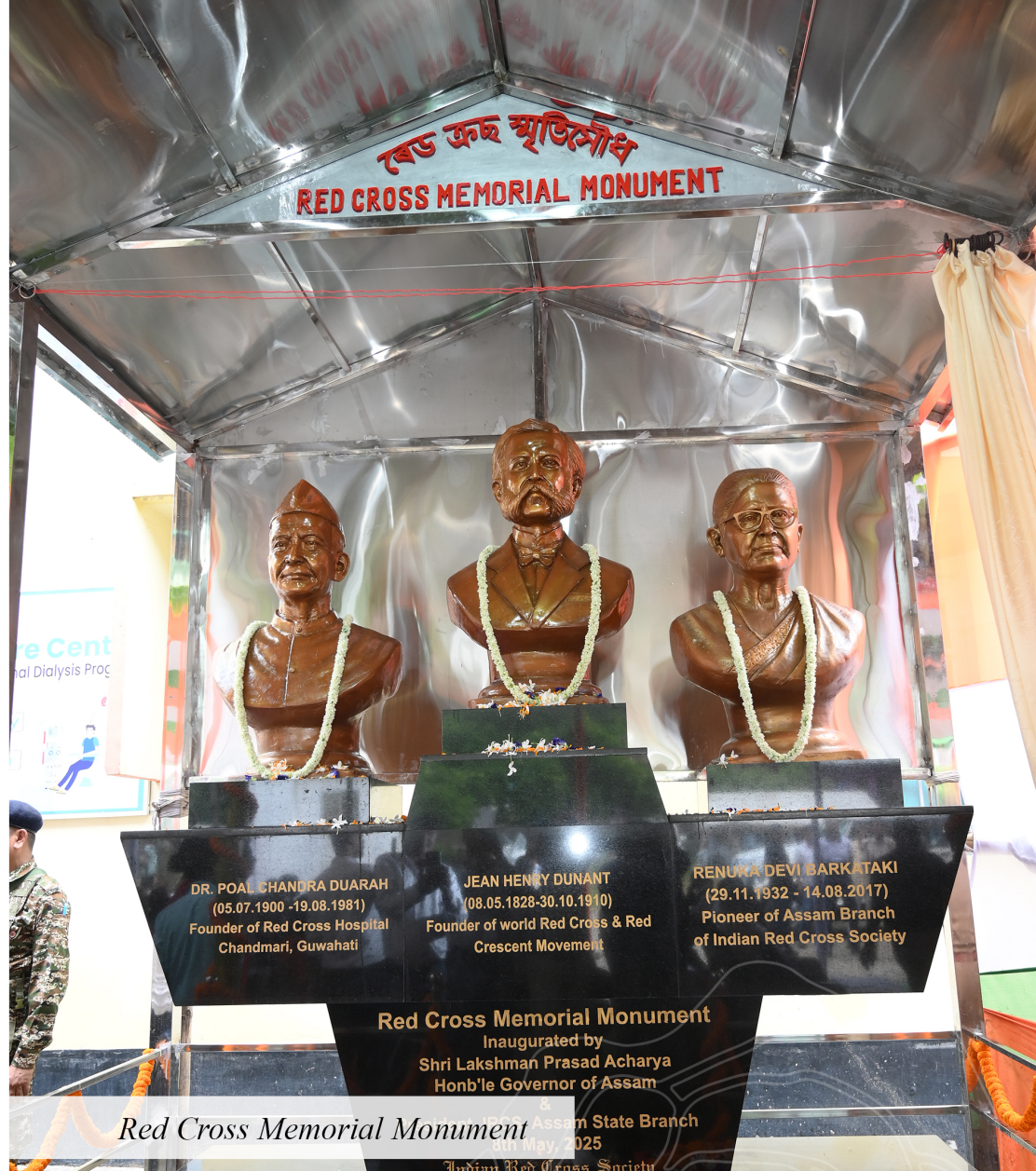
Red Cross Memorial Monument