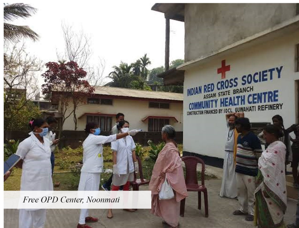
Free OPD Center, Noonmati