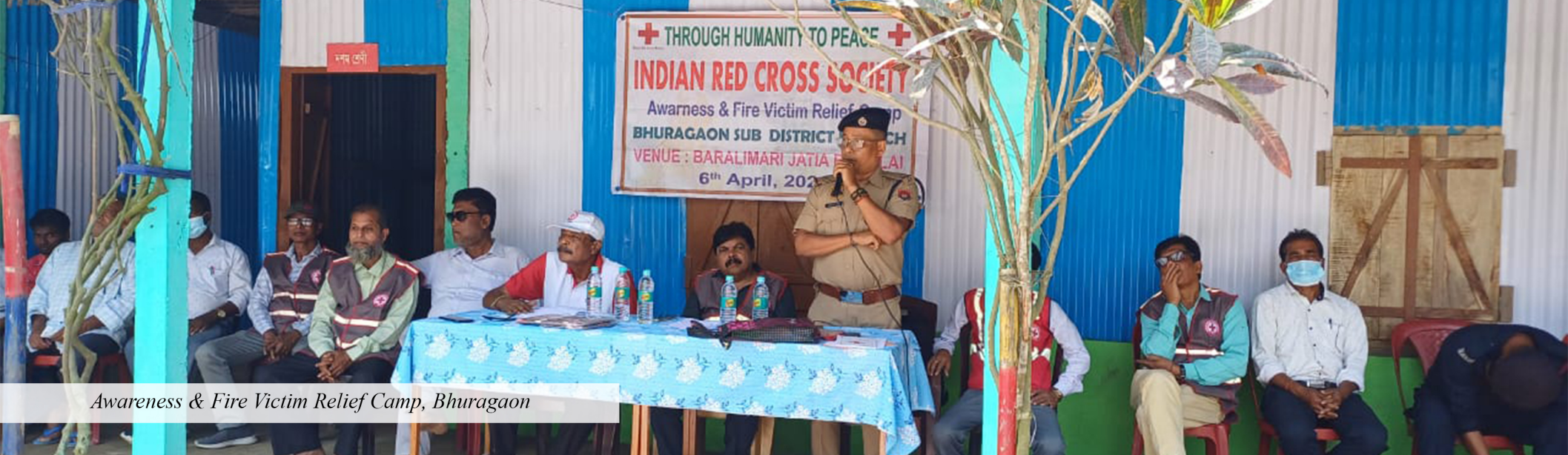
Awareness & Fire Victim Relief Camp, Bhuragaon