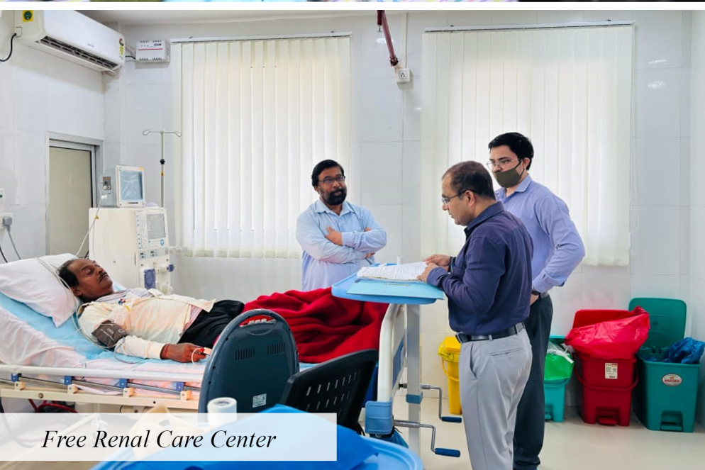
Free Renal Care Center