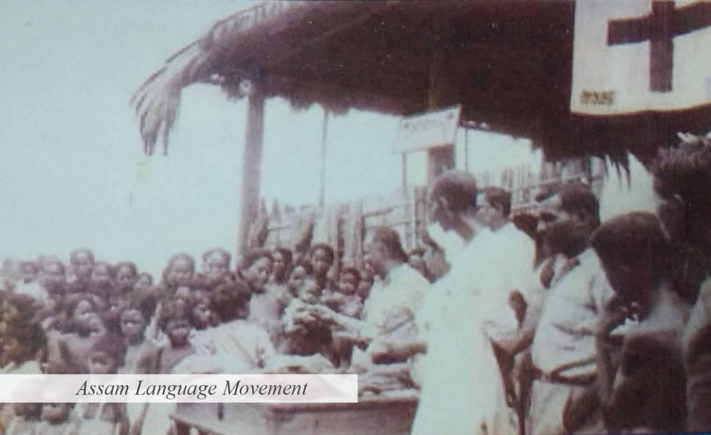
Assam Language Movement