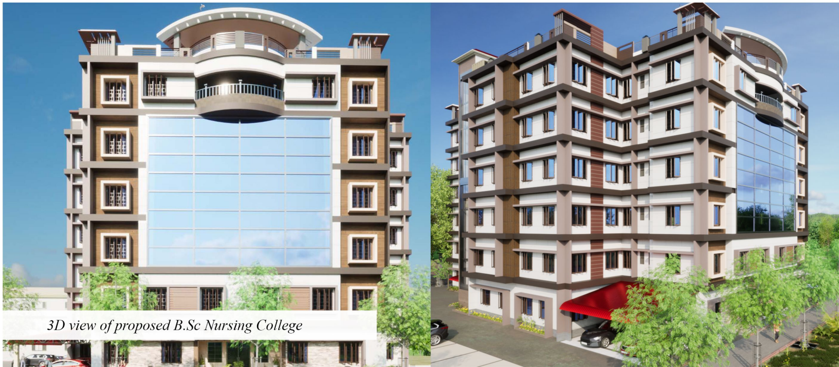
3D view of proposed B.Sc Nursing College