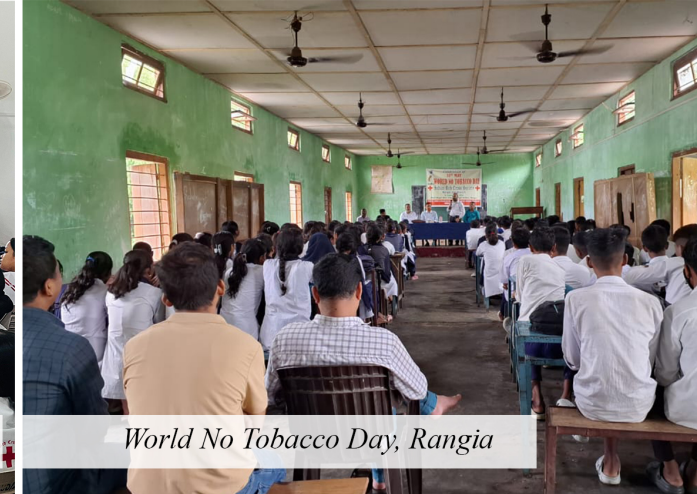
World No Tobacco Day, Rangia