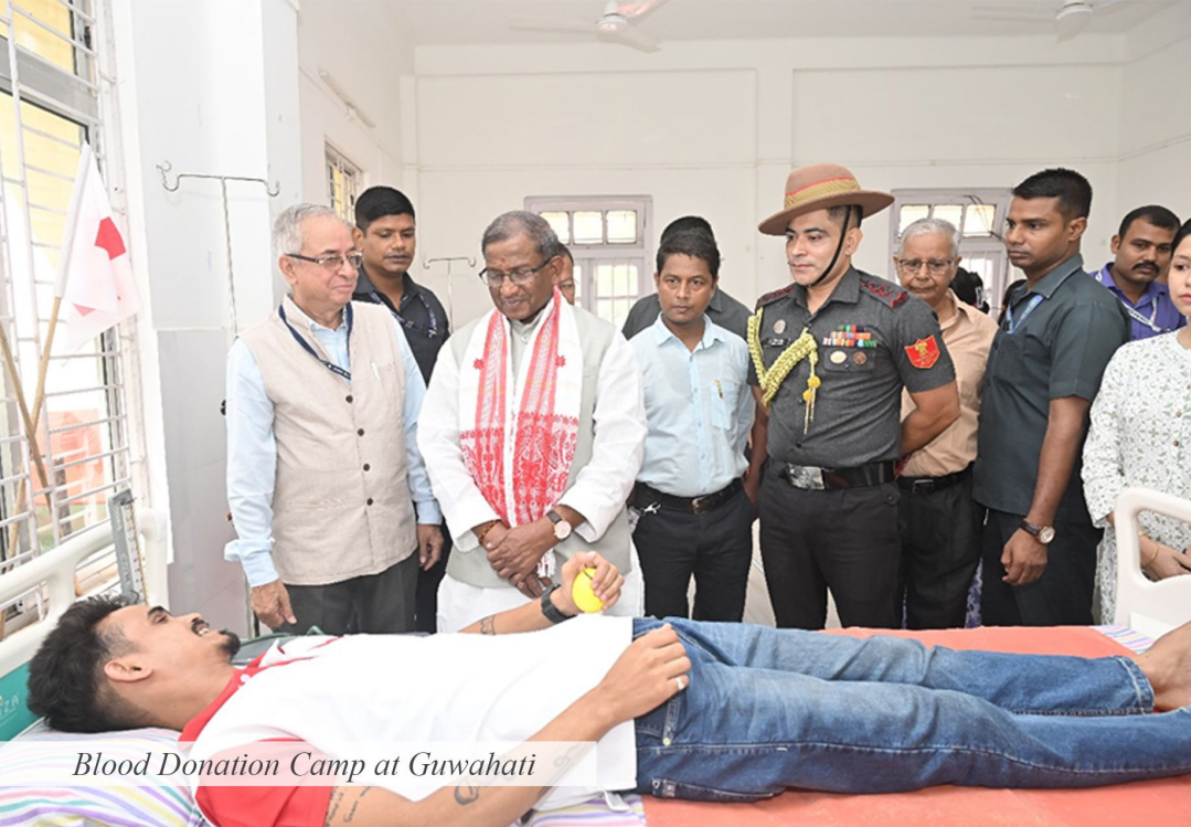
Blood Donation Camp at Guwahati