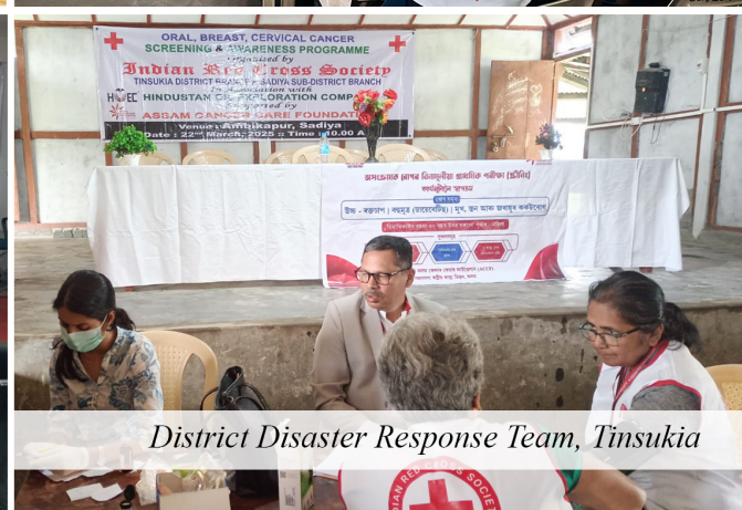
District Disaster Response Team, Tinsukia