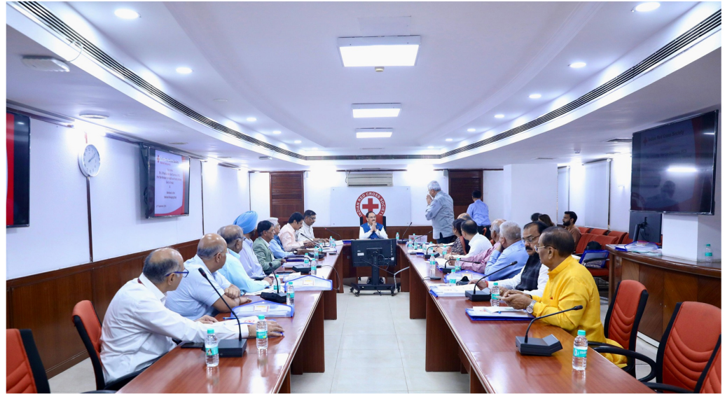
Hon'ble Chairman Shri J.P. Nadda chairing a meeting at National Head Quarters