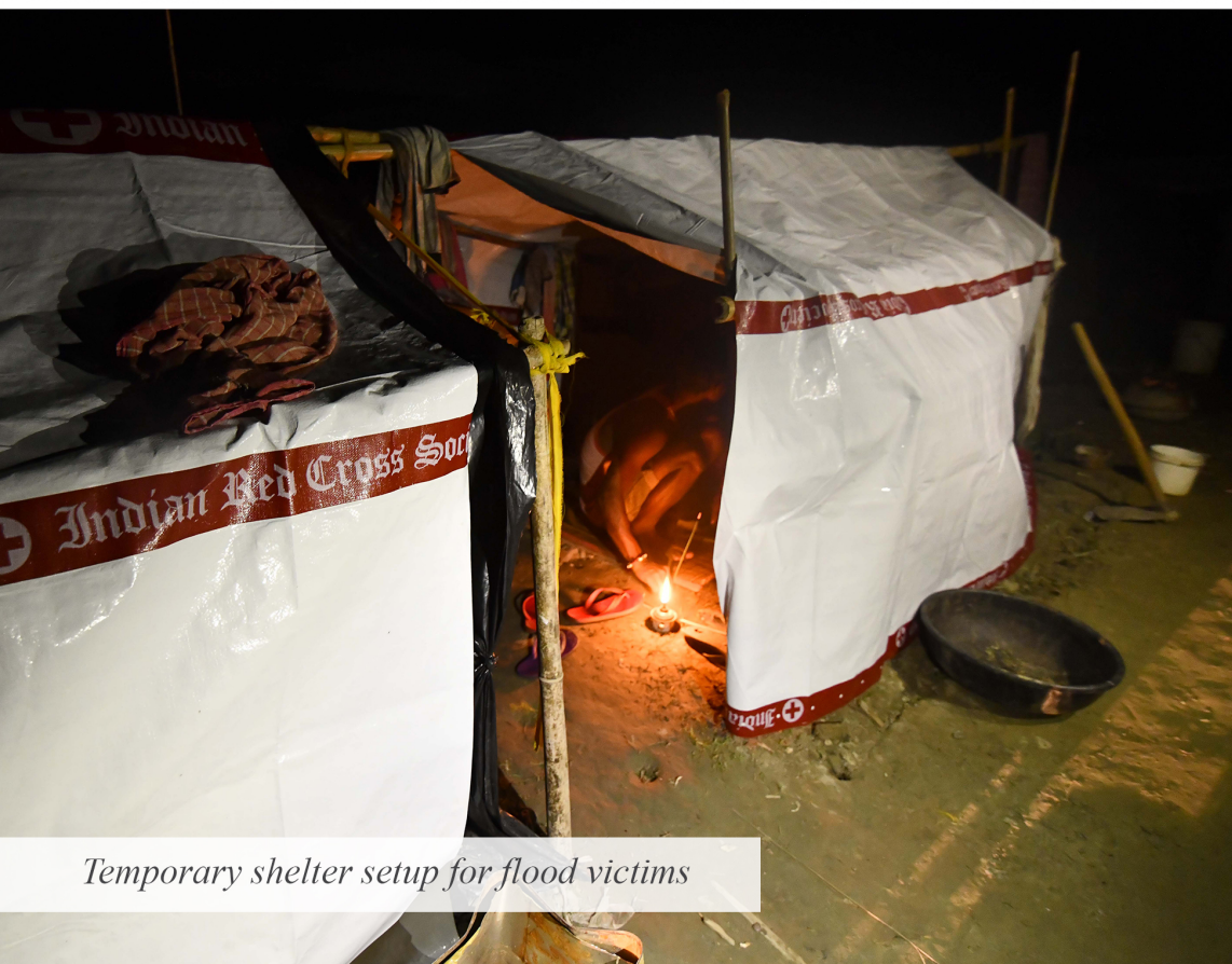
Temporary shelter setup for flood victims