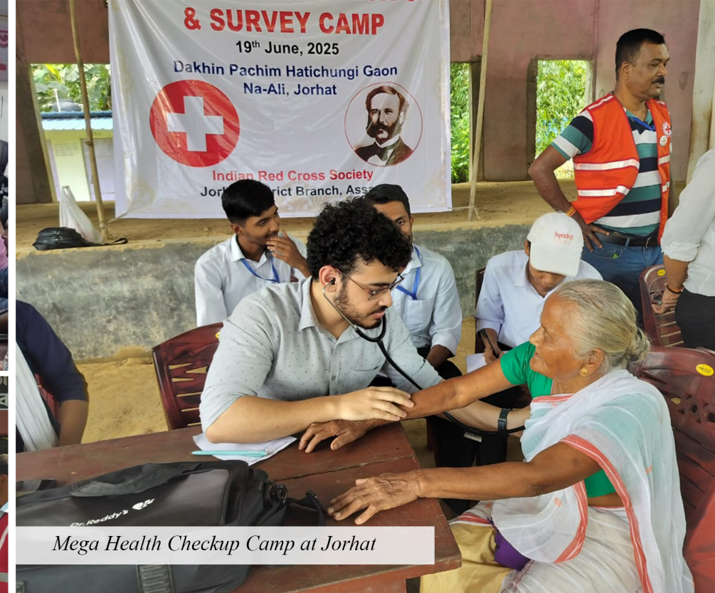
Mega Health Checkup Camp at Jorhat