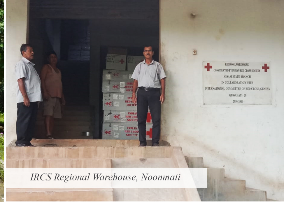
IRCS Regional Warehouse, Noonmati