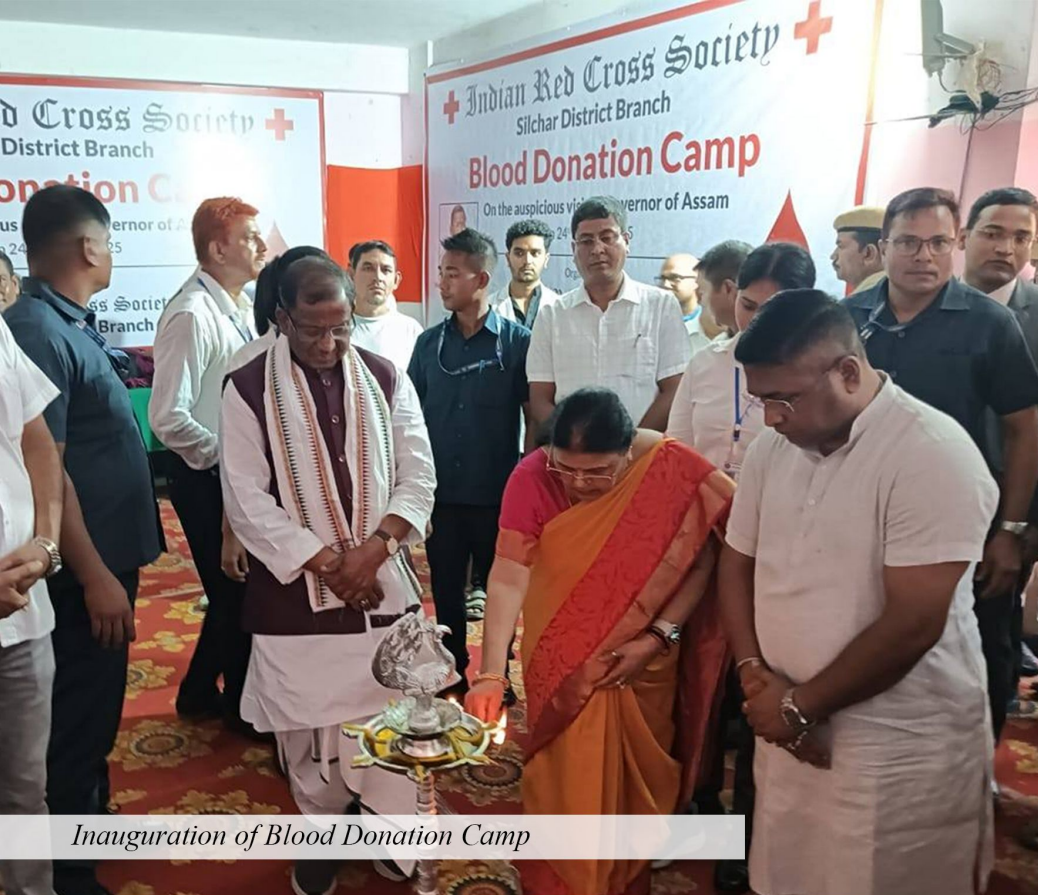
Inauguration of Blood Donation Camp