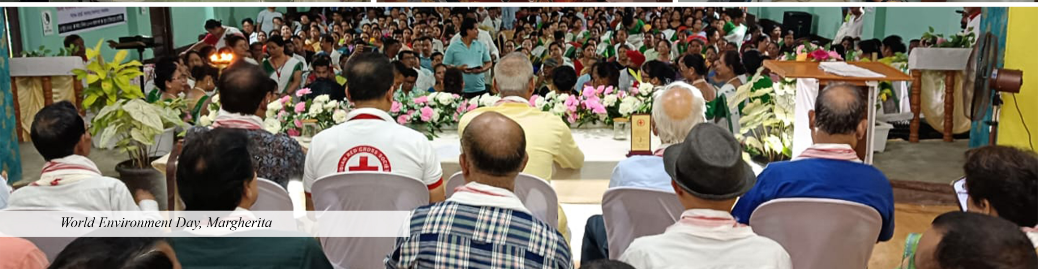
World Environment Day, Margherita