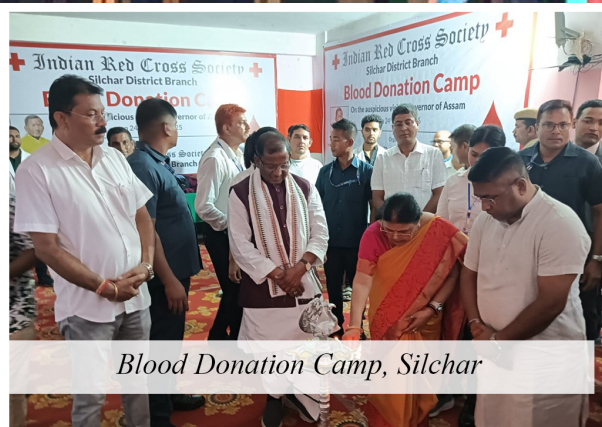
Blood Donation Camp, Silchar