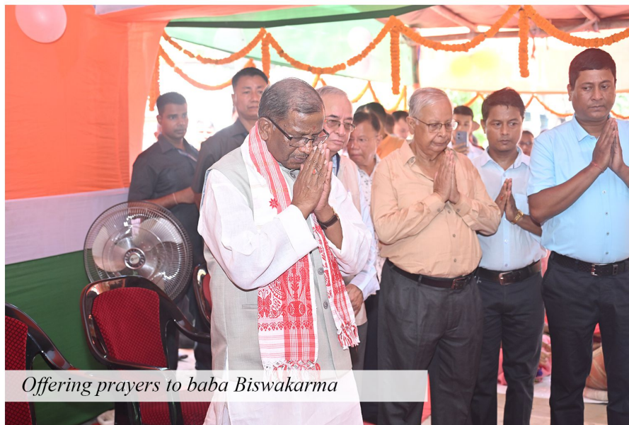
Offering prayers to baba Biswakarma

T he Honourable Governor joined the Viswakarma Puja celebrations at the Indian Red Cross Society, Assam State Branch. On this occasion, a blood donation camp was also organized, where donors participated with great enthusiasm, blending tradition with the noble cause of saving lives.