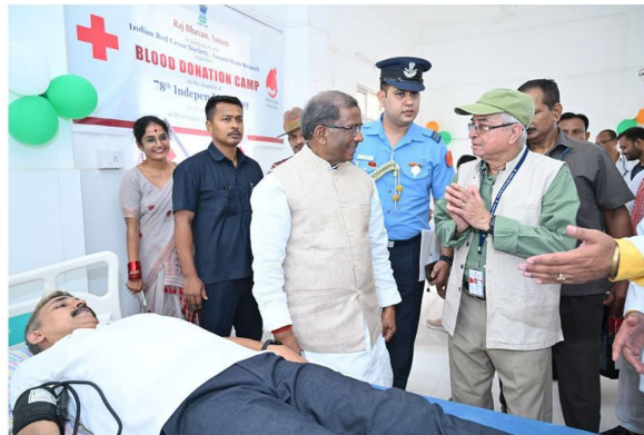
Blood donation camp

O n the occasion of Independence Day, the Honourable Governor attended the celebration and addressed the volunteers, members, students, teachers, staff on the occasion at the Indian Red Cross Society, Guwahati District Branch premises. A blood donation camp was also inaugurated by him, where volunteers came forward to donate blood, reflecting the spirit of freedom through service to humanity.