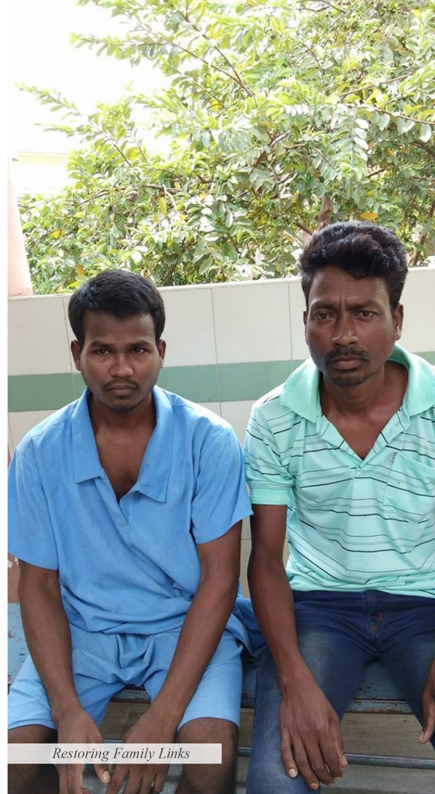
Restoring Family Links