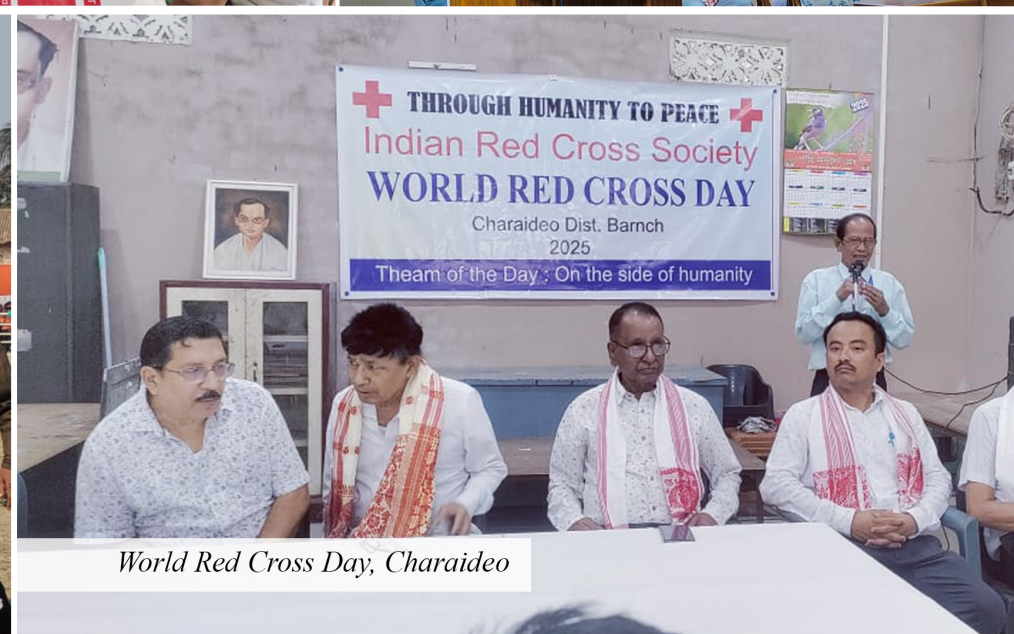
World Red Cross Day, Charaideo