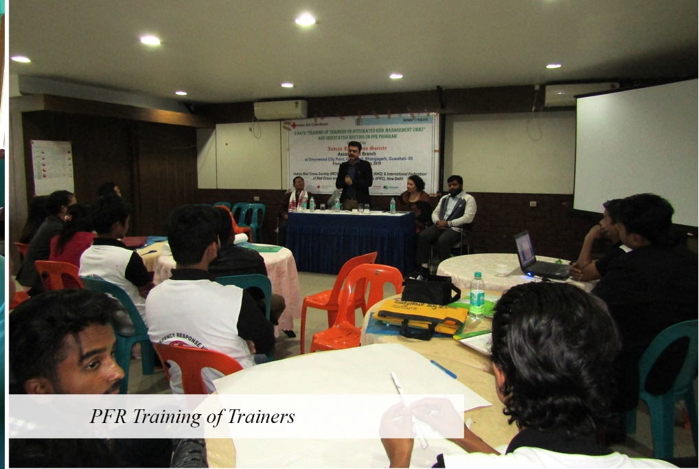
PFR Training of Trainers