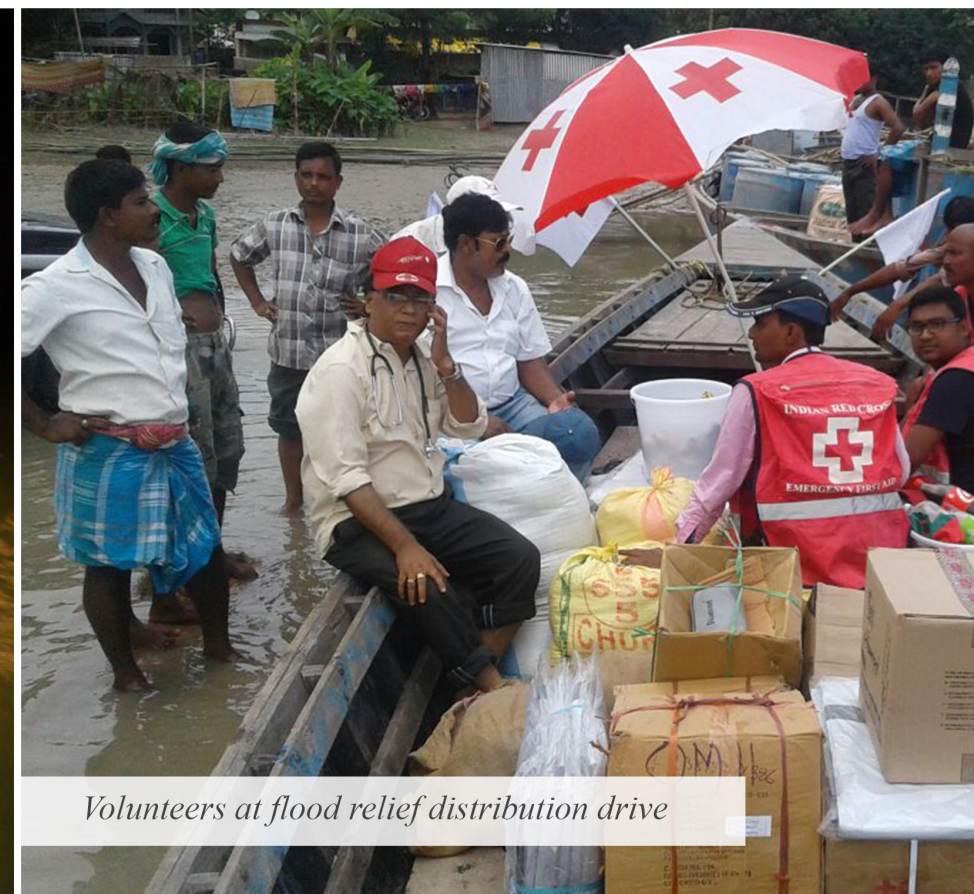
Volunteers at flood relief distribution drive