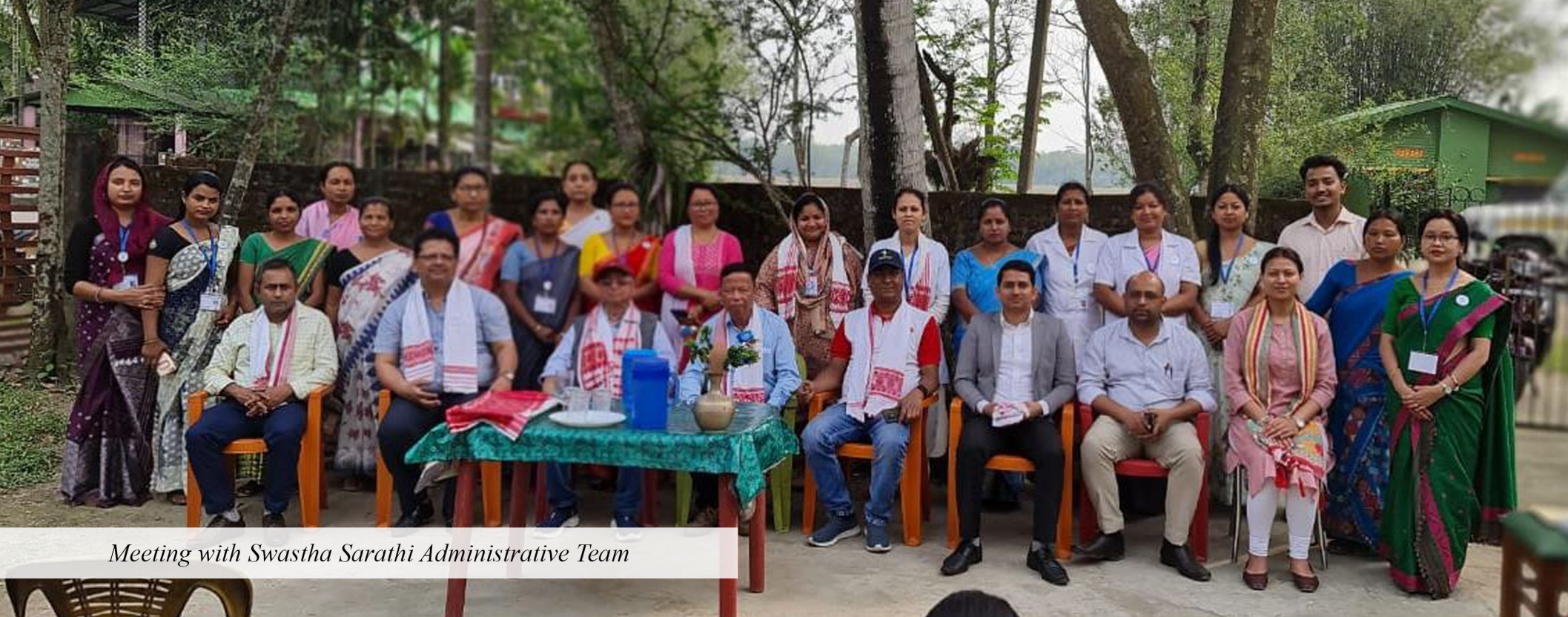
Meeting with Swastha Sarathi Administrative Team