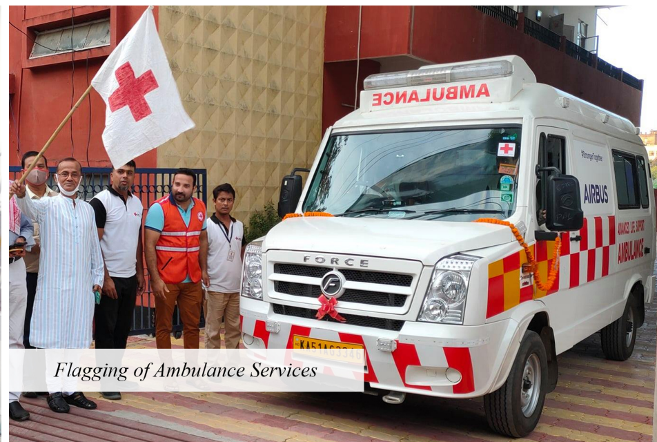
Flagging of Ambulance Services