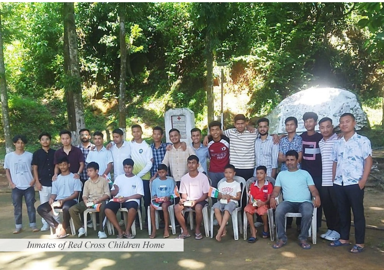
Inmates of Red Cross Children Home