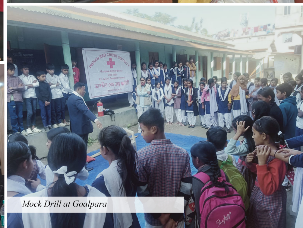
Mock Drill at Goalpara