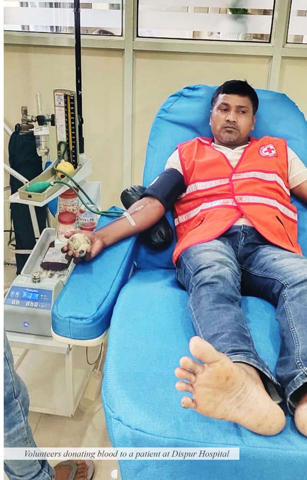
Volunteers donating blood to a patient at Dispur Hospital