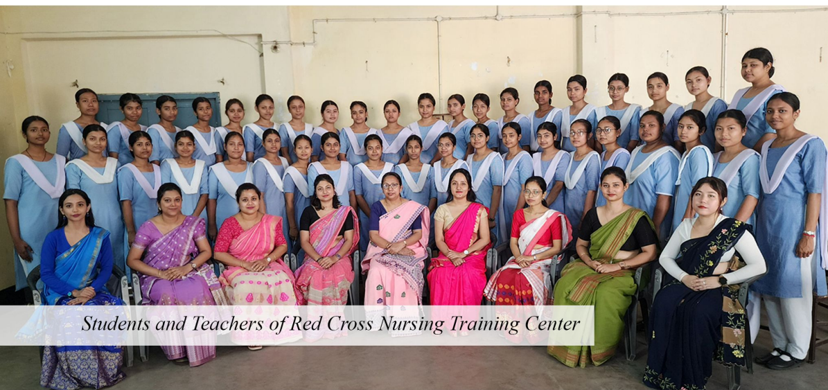
Students and Teachers of Red Cross Nursing Training Center