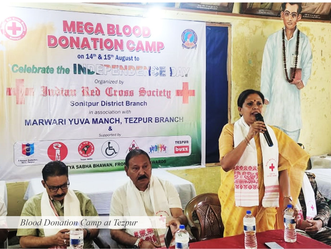
Blood Donation Camp at Tezpur