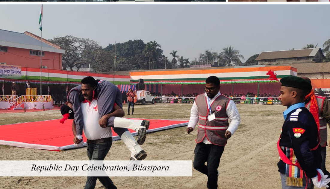
Republic Day Celenbration, Bilasipara