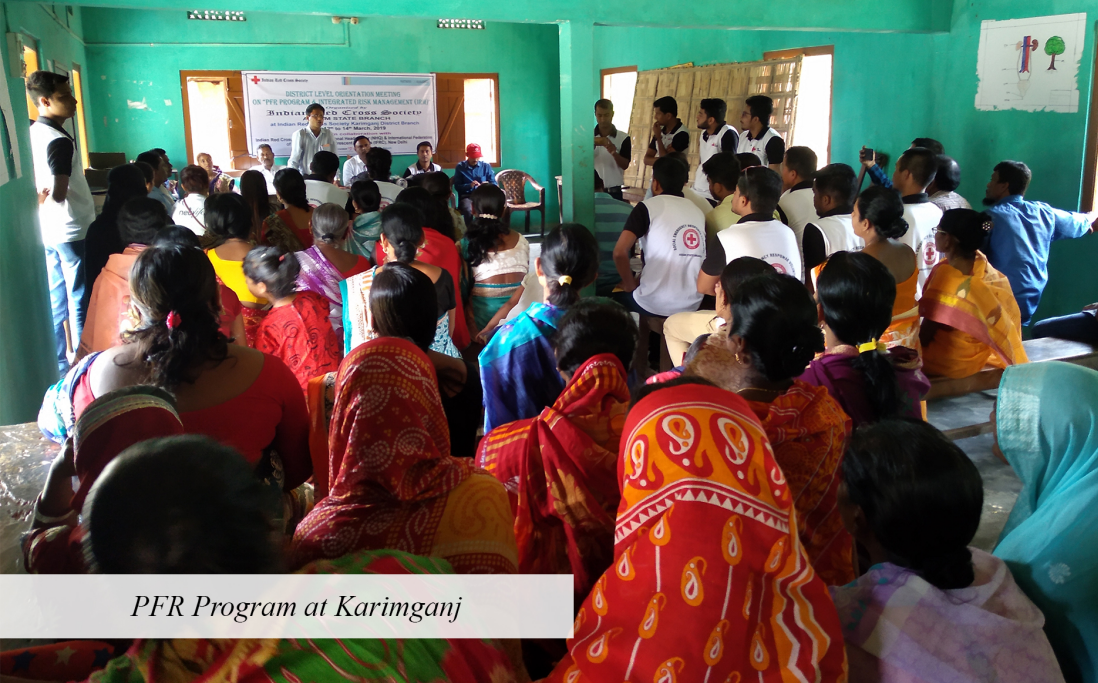
PFR Program at Karimganj