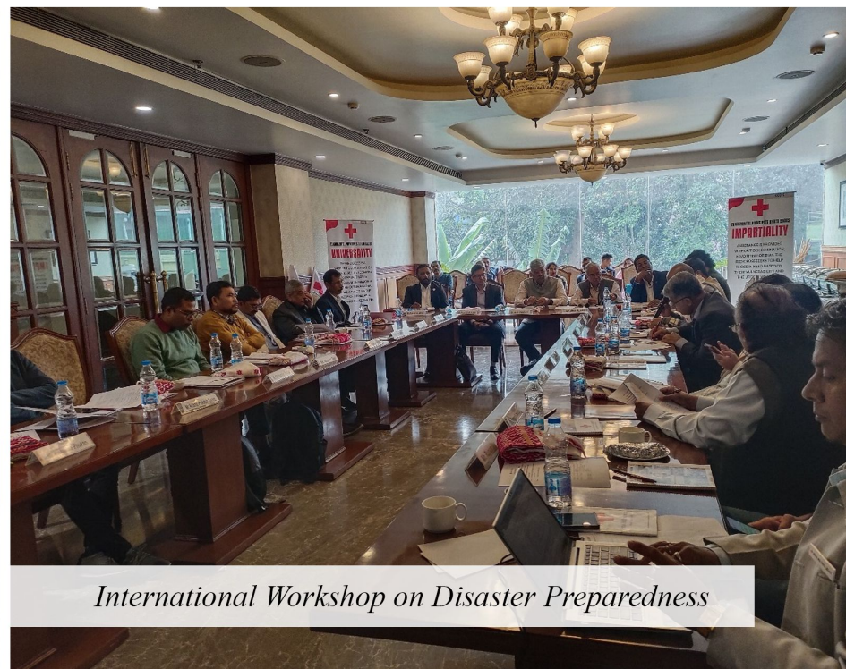
International Workshop on Disaster Preparedness